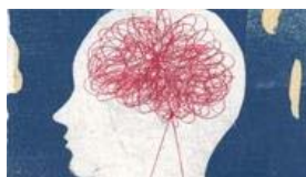
Blowback: Readers take on The Times