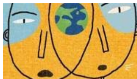
The Reply: Opinion writers respond to reader comments and letters

The district is right to let the computers go home with the students, and it's critical to involve parents. The principals we work with say training parents to email teachers and monitor grades engages them in their children's education like nothing else has.