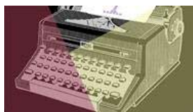
Submit a Letter to the Editor